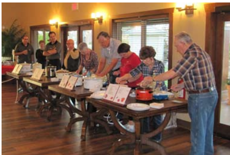
The "Chili" Line